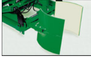
Giant Jaws for steel and fiber drums 18-28 in. in diameter.