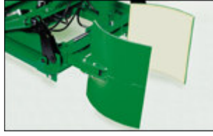
Giant Jaws for steel and fiber drums 18-28 in. in diameter.