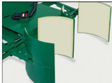
Giant Jaws for steel and fiber drums 18-28 in. in diameter.