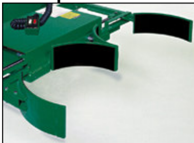
Standard Jaws for steel drums and cylinders 8-28 in. in diameter.