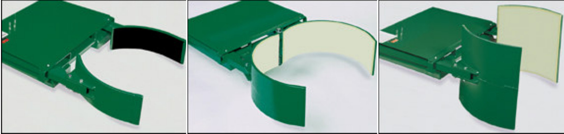
Standard Jaws for steel drums and cylinders 8-28 in. in diameter.