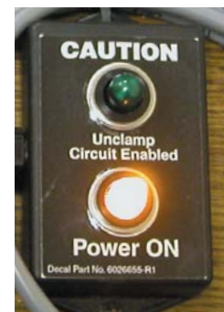
Yellow light: Power on.