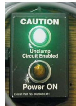
Green light: Unclamp circuit enabled.

Reduce the costs of damage from premature unclamping.