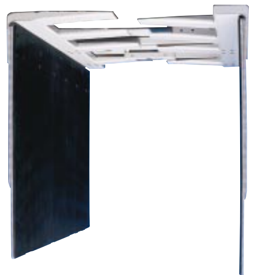
The razorback's thin, non-articulated arms make it easy to knife between loads in trailers and containers

Tapered arms for knifing between loads make appliance handling faster than ever.